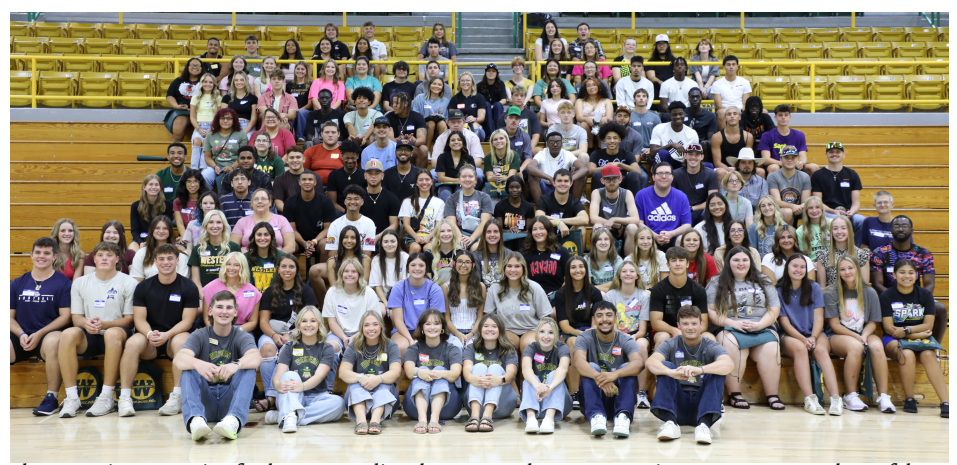
Photo Caption: Incoming freshman attending the 2024 Freshman Connection. Front row: Members of the Western Ambassador team assisting with campus tours.

With the fall semester about to kick off on Thursday, August 8th, Western welcomed close to 150 bright and eager incoming freshmen at Freshman Connection! Students had the chance to meet new friends, speak to instructors, and learn tips for success at Western.