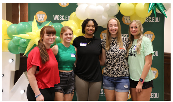
Photo Caption: Members for the 2024-25 Lady Pioneer's basketball team attending Freshman Connection.

Aug. 29 | Welcome Back Bingo | 6 PM | PHC